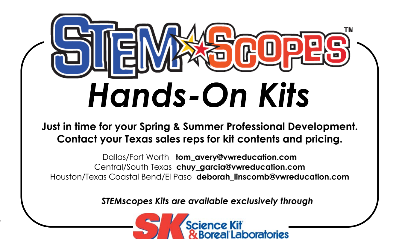
Table 3: Comparison of STEM sample GALT data by gender